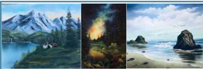
Mountain Scene Galaxy Grandeur Seascape