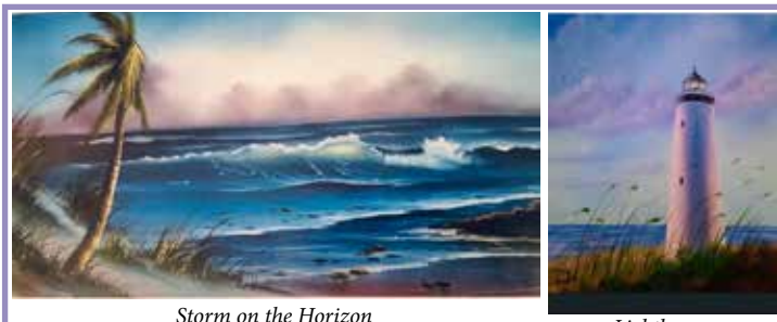
Storm on the Horizon

Age: Adult Fee: $55 per 5-week session Tuesdays 1:30 - 4:00 pm July 25, August 1, 8, 15, & 22 Tuesdays 1:30 - 4:00 pm August 29, September 5, 12, 19 & 22 *See the Hayner Center's website for information about a drop-in option.