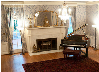
1st Floor East Room Seats 60 - 70 7' Yamaha grand piano