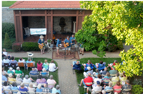
Courtyard seats 150 seasonal, no lighting