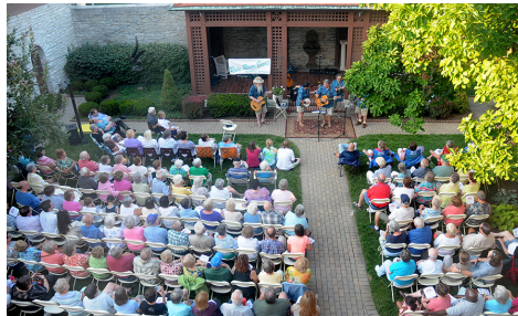
Courtyard seats 150 seasonal, no lighting