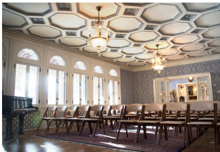
1st Floor East Room Seats 60 - 70 7' Yamaha grand piano